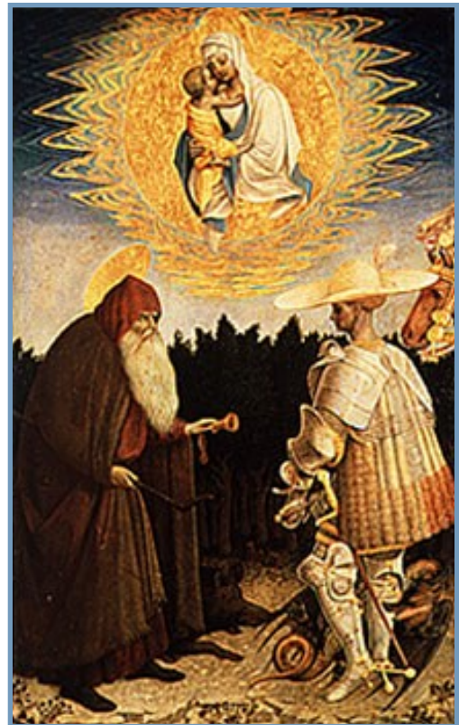
St. Anthony, Abbott January 17th

Isaiah 62:1-5/Psalm 96:1-2, 2-3, 7-8, 9-10 (3)/ 1 Corinthians 12:4-11/John 2:1-11