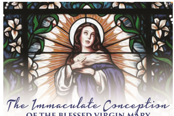
The Immaculate Conception OF THE BLESSED VIRGIN MARY -DECEMBER 8-